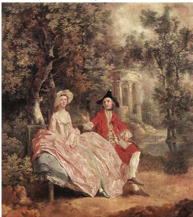
Conversation in a Park Thomas Gainsborough 1727 - 1788

quick 'yes' or 'no' response to a potential lover with a flick of a finger. While this may be a convenient stay at home in your PJs form of dating, the culture surrounding personal ideals then becomes inflated. Despite knowing nothing about the person on screen (apart from their- maybe deceiving- photo), users can quickly reject or accept an individual. If love has become this superficial, will any one find true, whole, fulfilling love today?