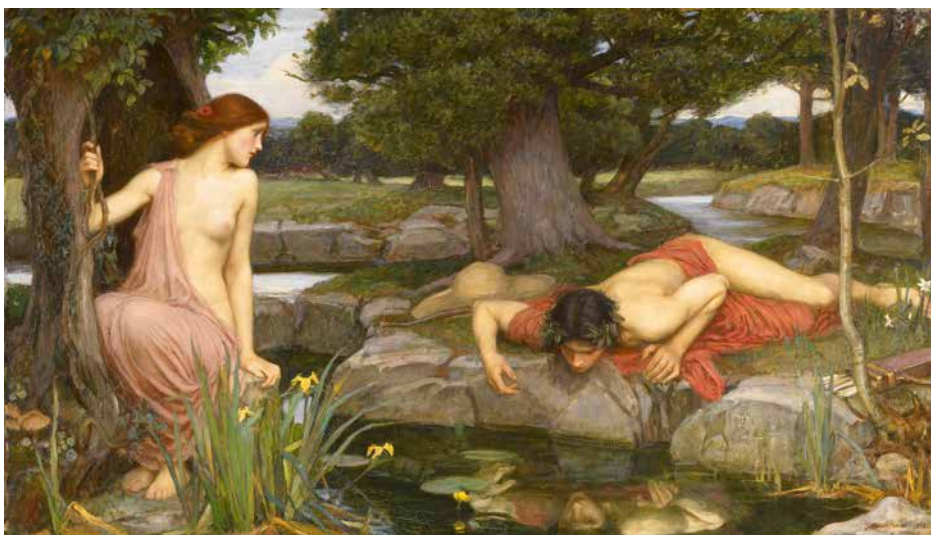
Echo and Narcissus 1903 by John William Waterhouse.

Expressions of love have evolved greatly over time. In the early 1900's boys were to ask parents of the girl they fancied for permission to spend time together. Parents predominantly supervised these meetings and commented as to whether the two were compatible on an intellectual and emotional level. It wasn't until the 20s that kids started rebelling and sneaking out for unsupervised dates. In the 40s, the term 'going steady' was coined and deemed official when the man gave his lady a piece of his clothing. Premarital sex became more common in the 50s and friends had more influence in approving of partners than family members. With the introduction of birth control in the 60s, ideas about dating changed and the 'hook up' culture began. This emphasized immediate attraction and forgave those who weren't interested in beginning a committed relationship. In all cases, both parties met face to face and spent a deal of time together. This is not to say that all fleeting meetings didn't turn into full-fledged love affairs. Some flings developed into long-term relationships that continued on steadily into the future. Juxtaposed with today's meetings, in some ways these are not dissimilar. Modern day lovers may meet in bars, cafes and catch up with friends. The more disparate factors lay with online dating sites such as Tinder and Clinks.