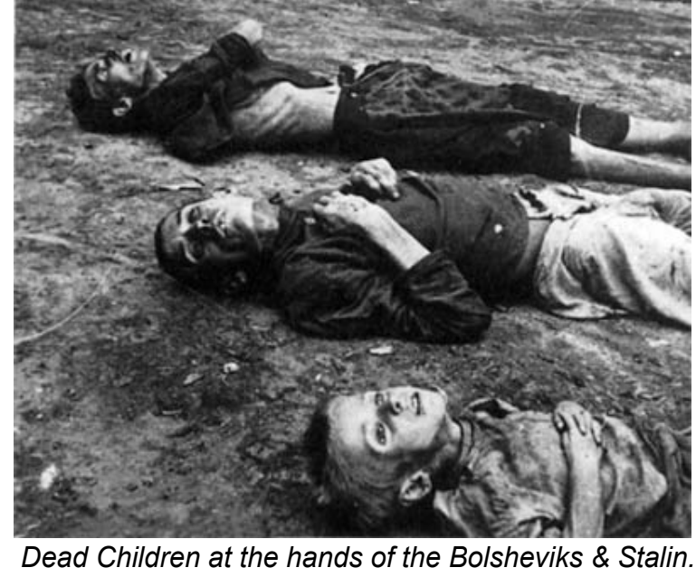
Dead Children at the hands of the Bolsheviks & Stalin. Ignored by Walter Duranty. 10 Million Ukrainian people perished as a result of the Holodomor

In the 1930s NYT’s Walter Duranty wrote glowing reports about life in the USSR, denying the forced starvation of millions in the Ukrainian Holodomor. He knew he was lying when he wrote the stuff. Soviet dictator Stalin loved it. Duranty’s fake news scored a Pulitzer Prize. Neither the Pulitzer Committee nor the NYT will left a finger to rescind it.