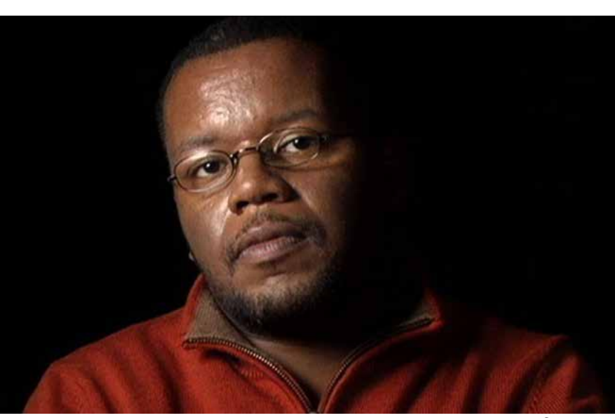
Jason Blair

In 2003 NYT reporter Jayson Blair was caught plagiarizing and fabricating award winning human interest stories which got tremendous play at the time. He only got caught because he was sloppy. Affirmative action was an issue in how he got hired.